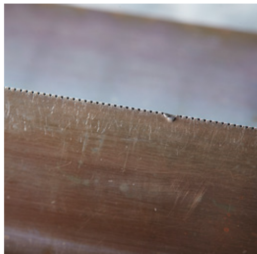
Example of a meltblown spinneret in before/after comparison

Talk to us – we will be happy to advise you.